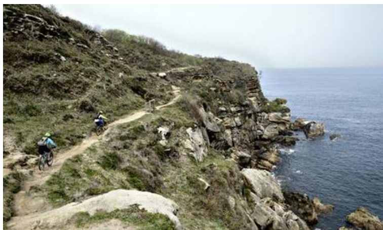
The rugged coastline east of San Sebastián

Pungent aromas from trailside flowers and bushes waft over us as Doug churns up the air ahead. The surf crashes away down below us. The sea is dotted with little fishing boats. We're instantly immersed in the sights, sounds and aromas of the coast.