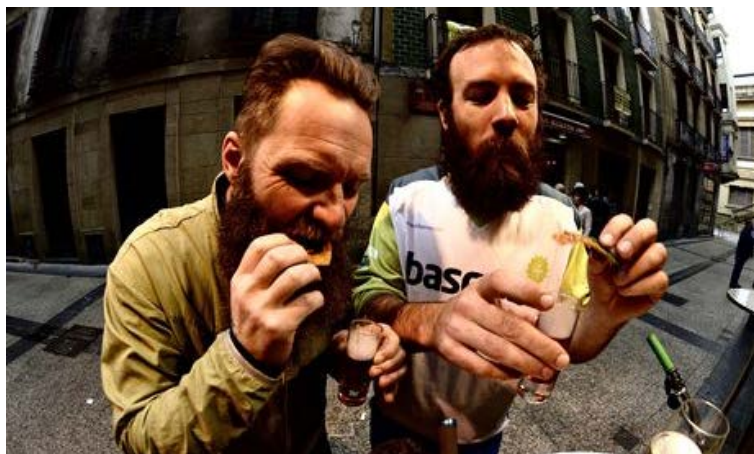
Tucking in to fantastic pintos in San Sebastián, with an appetite sharpened by mountain biking.